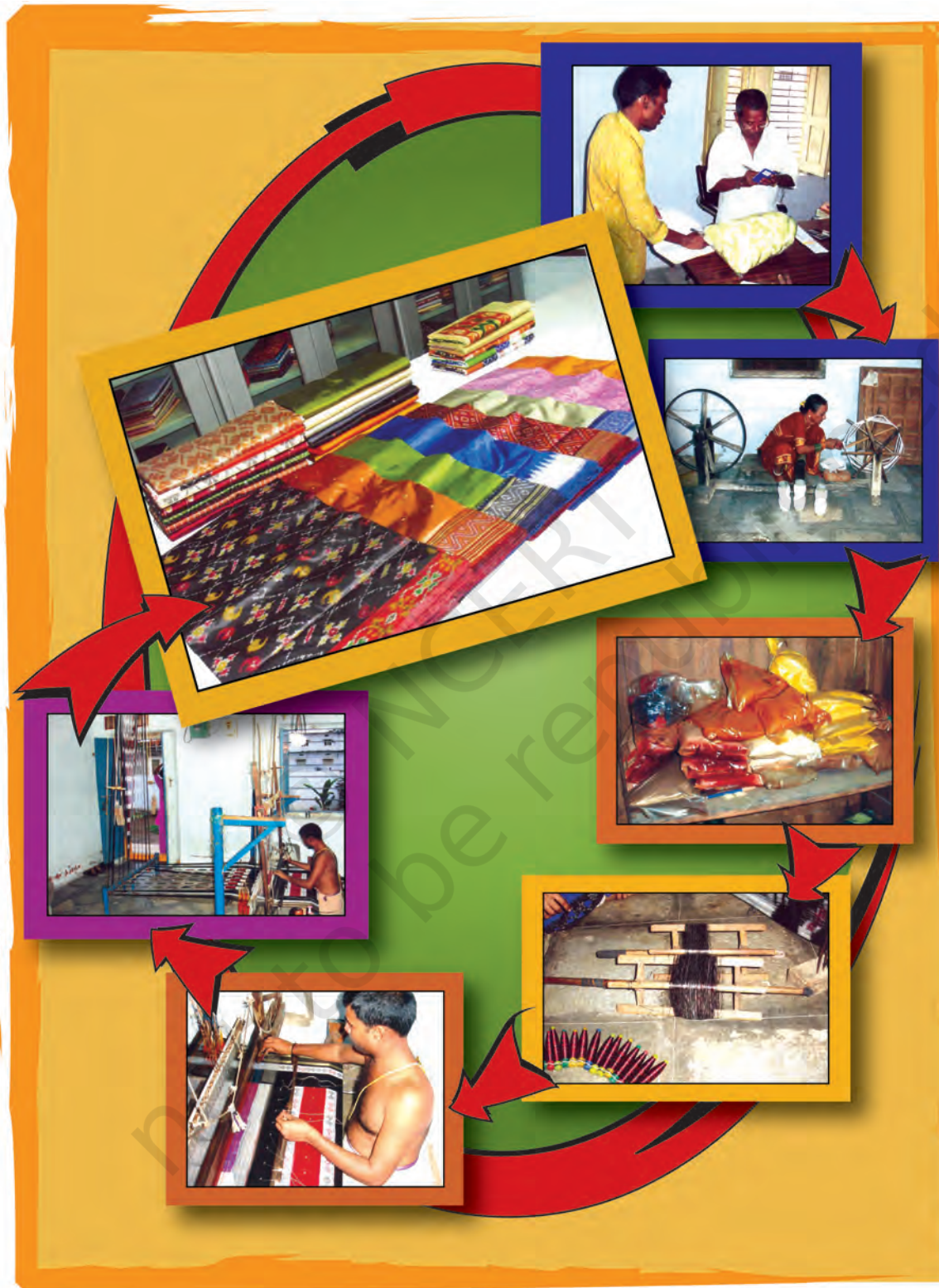
Process of making pochampalli sarees